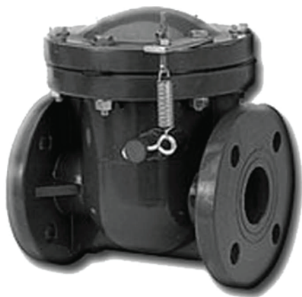
SERIES PVC-380 PVC HORIZONTAL SWING CHECK VALVE HEAVY DUTY BODY MATERIAL

AVAILABLE IN SIZES 6" AND 10" AVAILABLE IN FLANGED ANSI B16.5 CLASS 150 STANDARDS OPTIONAL PVC/PP SCREEN LESS THAN 1PSI TO OPEN REQUIRES 3-5PSI TO CLOSE TIGHT THERMOPLASTIC VALVE BODY