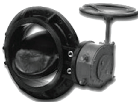
SERIES PVC-320 PVC GEAR OPERATOR BUTTERFLY VALVE IDEAL SOLUTION FOR WASTEWATER

SIZES BETWEEN 2" - 8" ONE PIECE DESIGN STANDARD POLYPROPYLENE (PP) DISC TEMPERATURE RATING OF UP TO 180F FULL BODY LINER SEAT CLASS 150# EPDM, VITON, BUNA-N, OR O-RING