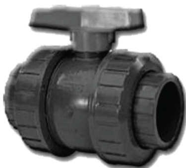
SERIES PVC-340 TRUE UNION PVC BALL VALVE SAFETY DESIGN - BLOW OUT PROOF

AVAILABLE IN SIZES 1/2" - 4" 3-WAY VALVE DESIGN T-PORT OR L-PORT FLOW FLANGED OR NPT ENDS SELF ADJUSTING FLOATING SEAT BUILT IN HANDLE LOCKOUT ISO PATTERN FOR ACTUATION