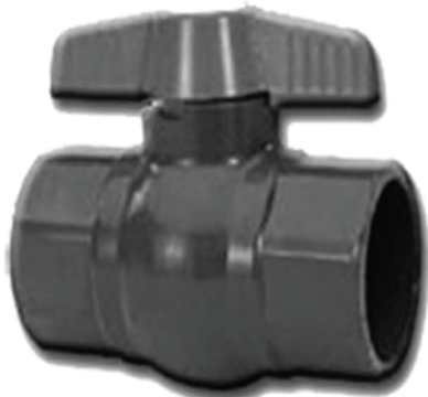
SERIES PVC-365 COMPACT PVC BALL VALVE ECONOMICAL PVC BALL VALVE

SIZES BETWEEN 1/2" - 4" ONE PIECE DESIGN STANDARD POLYPROPYLENE (PP) DISC NSF APPROVED 150PSI WORKING PRESSURE MANUAL HANDLE OPERATOR AVAILABLE FOR ACTUATION