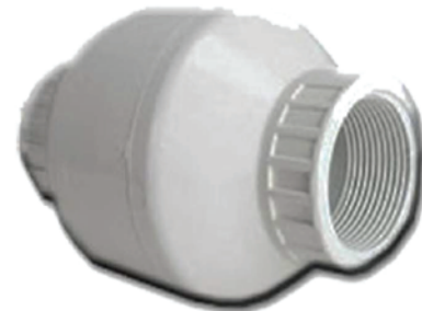
SERIES PVC-385 PVC CHECK VALVE HEAVY DUTY BODY MATERIAL

AVAILABLE IN SIZES 1/2" - 2" HEAVY DUTY DIAPHRAGM FULLY LUBRICATED STEM AND SLEEVE PTFE AND EPDM DIAPHRAGM ADJUSTABLE FULL CLOSE EASY MANUAL CONTROL ANSI 150# APPROVED