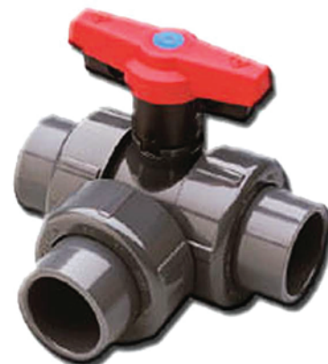
SERIES PVC-400 3-WAY PVC BALL VALVE TRUE UNION VALVE BODY DESIGN

AVAILABLE IN SIZES 8" - 24" VERY EASY INSTALL PROCESS ONE PIECE DESIGN VARIOUS CONFIGURATIONS AVAILABLE 180F TEMPERATURE RATING EASY MANUAL CONTROL DIRECT BOLT ON