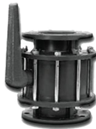
SERIES PVC-360 PVC BALL VALVE (6") HIGH PERFORMANCE DESIGN

TRUE UNION VALVE BODY DESIGN AVAILABLE IN 4" SIZE DOUBLE UNION DESIGN LONG LIFE, TFE SEATS FULL PORT VALVE DESIGN STEM HAS INTERNAL LAND