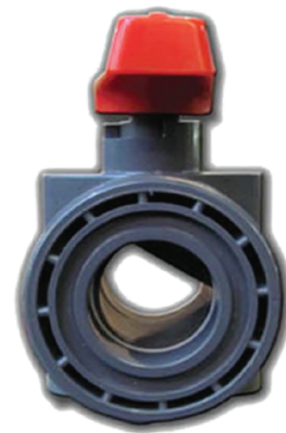
SERIES VC-700 PVC V BALL VALVE OFFERED IN FLANGED OR NPT

LESS THAN 1PSI TO OPEN AVAILABLE IN SIZES 1/2" - 4" OPTIONAL PVC SCREEN ASSEMBLY SOCKET, THREADED OR FLANGED ENDS EASY TO REPLACE SEATS AND SEALS EXCELLENT FLOW CHARACTERISTIC