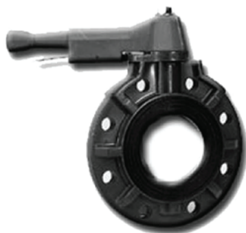
SERIES PVC-310 PVC WAFER STYLE BUTTERFLY VALVE AVAILABLE IN WAFER STYLE ONLY

SIZES BETWEEN 2" - 8" ONE PIECE DESIGN STANDARD POLYPROPYLENE (PP) DISC TEMPERATURE RATING OF UP TO 180F FULL BODY LINER SEAT CLASS 150# EPDM, VITON, BUNA-N, OR O-RING