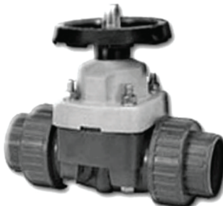
SERIES PVC-375 PVC TRUE UNION DIAPHRAGM VALVE HEAVY DUTY BODY MATERIAL

SIZES BETWEEN 1/2" - 4" ONE PIECE DESIGN STANDARD POLYPROPYLENE (PP) DISC NSF APPROVED 150PSI WORKING PRESSURE MANUAL HANDLE OPERATOR AVAILABLE FOR ACTUATION