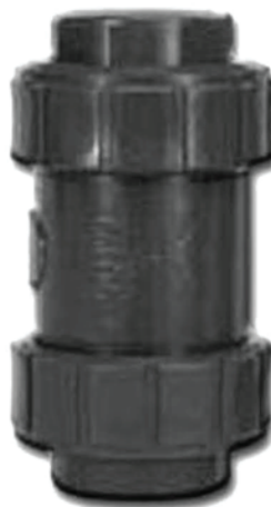
SERIES PVC-390 PVC BALL CHECK VALVE ECONOMICAL PVC BALL CHECK VALVE

TOP ENTRY DESIGN AVAILABLE IN SIZES 3/4" - 8" MINIMAL REQUIRED BACK PRESSURE FULL OPEN STOP TO PREVENT TRAVEL FULL FACED SEAT STAINLESS STEEL EXTENSION FASTENER