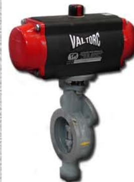
Triple-Offset Butterfly Valves