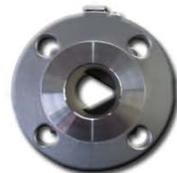
V-Ball Valves (For Steam and Water Control)