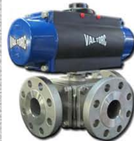
3-Way Actuated Ball Valves