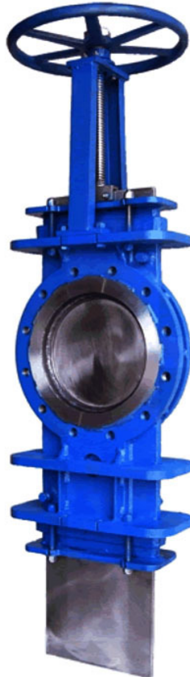
FABRICATED SLIDE GATE VALVE

Pulp & Paper Mining Power Chemical Industrial Petroleum